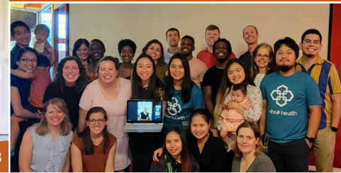
THE GROWING TEAM — MAY 2022