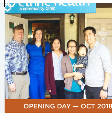
OPENING DAY — OCT 2018