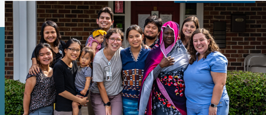
CCHF CONFERENCE — APR 2022